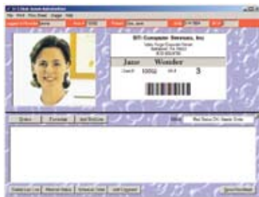
Photo Identification and Bar Coding

Each patient's schedule contains a picture of the patient to eliminate the chance of mistaken identity. Each patient account has a unique barcode to further help match the patient with the appropriate serum.