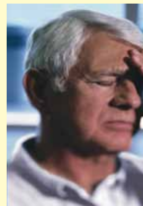
These are difficult times to