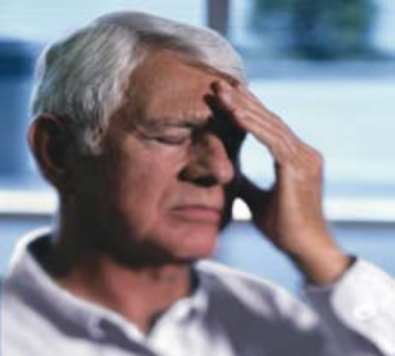
These are difficult times to practice medicine.

Medical Economics Magazine; May 24, 1999; pgs 177-190